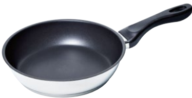
The frying sensor pan GP 900

Having chosen one of five preset temperature levels, the private chef can rest assured that the sensor will precisely maintain the desired temperature. There are four sizes of pan, ranging from 15 cm to 28 cm diameter.