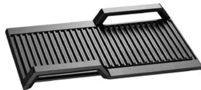
The griddle plate CA 052

The cast aluminium griddle plate is a non-stick surface with intense searing abilities.