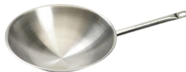
The Wok pan WP 400

The round bottomed wok of multi-ply material allows for authentic Asian cooking on an induction, when used in conjunction with the wok ring.