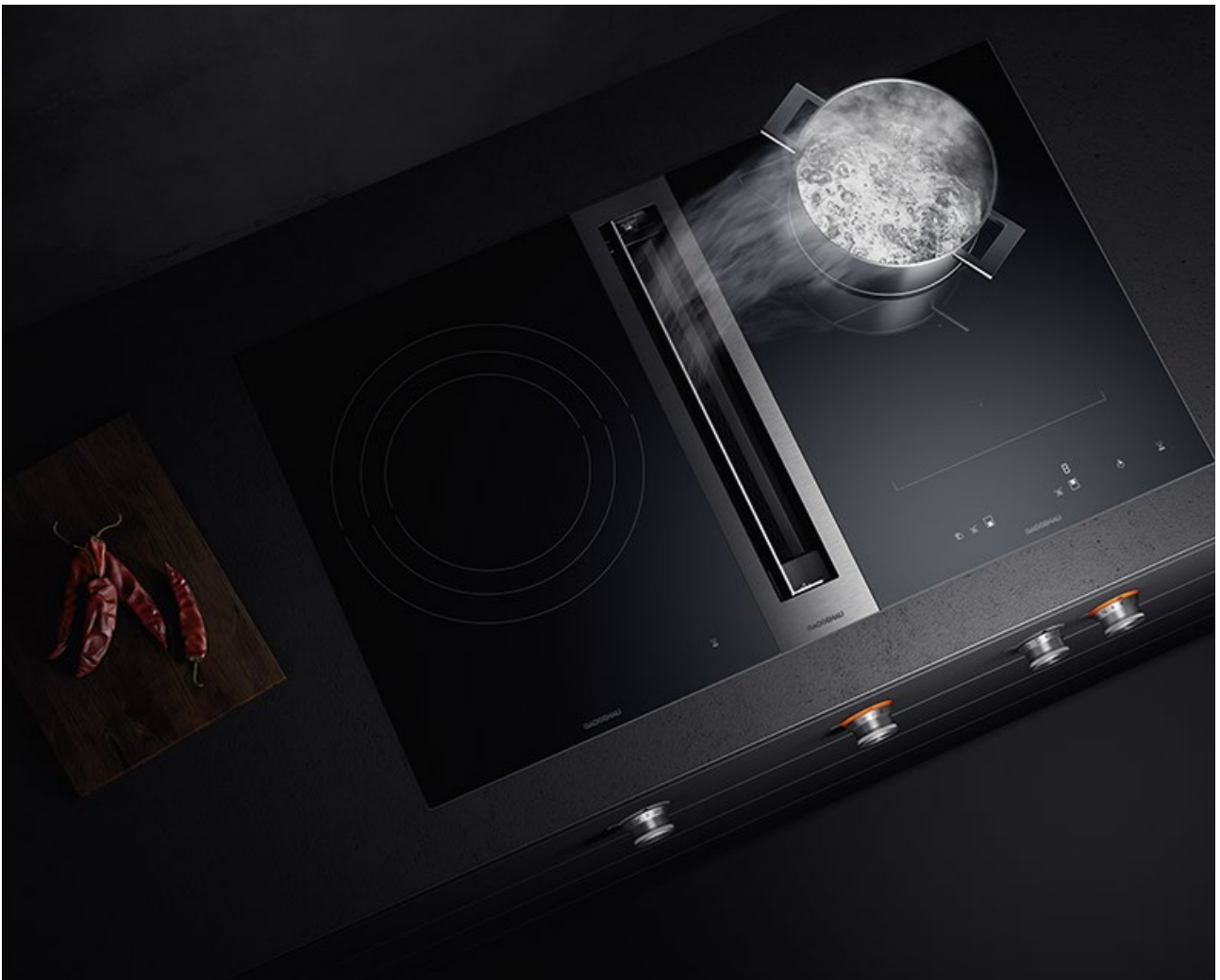
The flex induction cooktops with downdraft ventilation