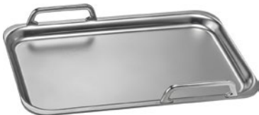
The Teppan Yaki CA 051

The Teppan Yaki is made specifically for the flex induction cooktop. A multi-ply material ensures direct heat transference and durability.